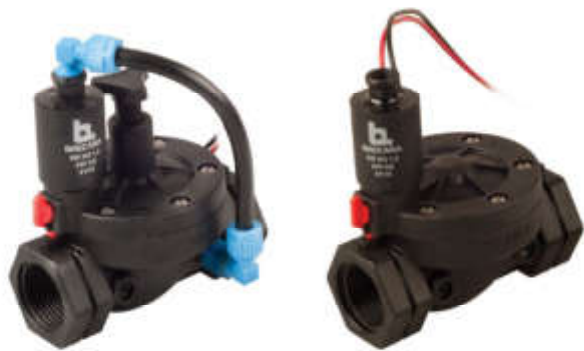
Upstream pilot control